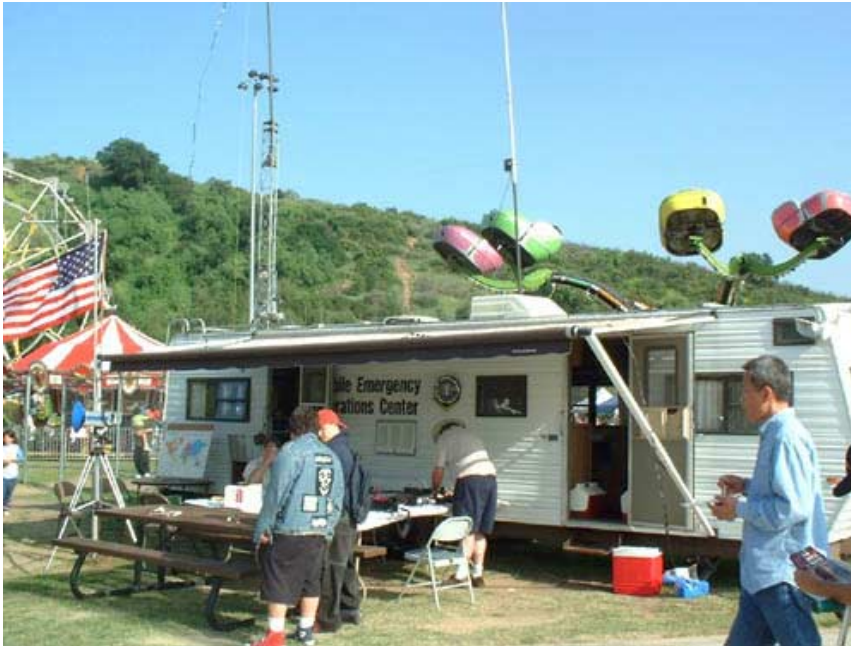
Activity at the EOC during the birthday celebration

ter that chases us away each year) to be heavy, and excitement to be high. Many hams stopped by to say hello and check out the gear, and many non-hams stopped by to learn who we were and play with the code oscillators laid out on the tables in front.