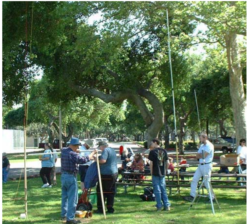
Look at all of these antennas—Ham radio at its best!