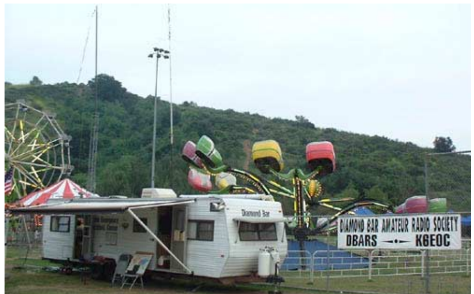
The EOC nestled in Petersen Park

Once the event began, we found traffic at our new location (much further down the concourse, away from the sheriff's helicop-